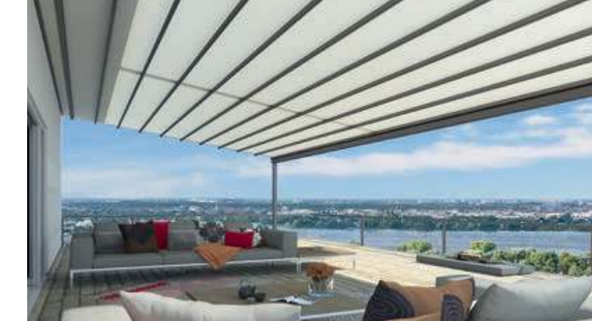
Frame colour WT 029/70786 | Pattern Pergona® transluzent PE 90W (white)

The special feature of the weinor Pergona® translucent fabric is its high light transmission of up to 21%. Natural light is able to penetrate the rainproof support fabric, but it prevents unpleasant dazzling by strong sunlight at the same time. Highstrength polyester fibres make the woven fabric extremely durable, long-lived and weather-resistant.